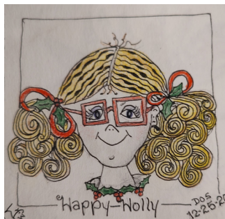
Holly was born on Christmas Day and she was always 'happy' until she found alcohol. Then for the next 10 years her holidays were a blur. Today Holly is looking forward to picking up her 2-year chip and happy to celebrate both of her birthdays.